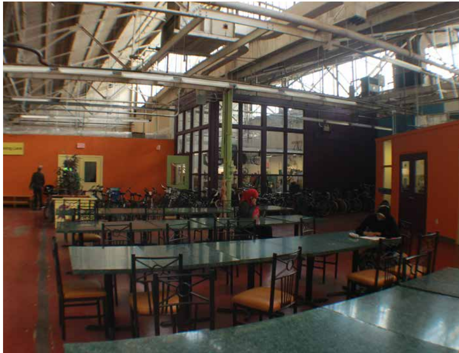
FIGURE 5.4 An indoor community space in Jane-Finch: The Learning Enrichment Foundation. / Source: Author.

In addition to third spaces such as indoor plazas, the lack of planned social infrastructure has also resulted in the creation of informal gathering places in private spaces. A unique example is the so-called “private bars”, i.e. private residential dwellings which also function as informal enterprises, where local residents can buy and consume alcohol (see Ahmadi & Tasan-Kok, 2015).