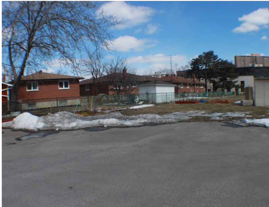
FIGURE 5.3 Community gardens in Jane-Finch.

“The problem that we have is that the powers that be see this area as a wasteland. Because there are a lot of people on social services and many of the buildings are subsidised housing and they don’t see it as people trying to come out, in their eyes, they say why bother.” [Male, El Salvadorian, 61-75, home-owner].