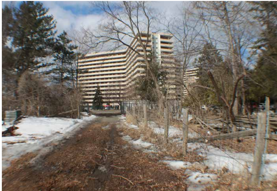
FIGURE 5.1 Example of an open space in Jane-Finch.