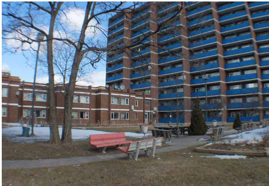
FIGURE 5.2 Examples of two housing types and an open space in Jane-Finch.